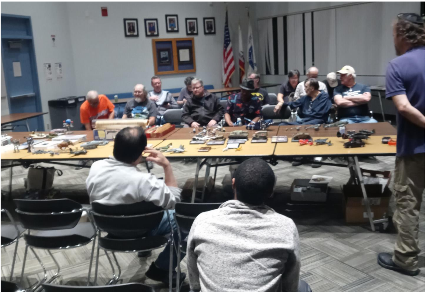
October SVSM to Remember Starts Here (cont'd from pg 1)