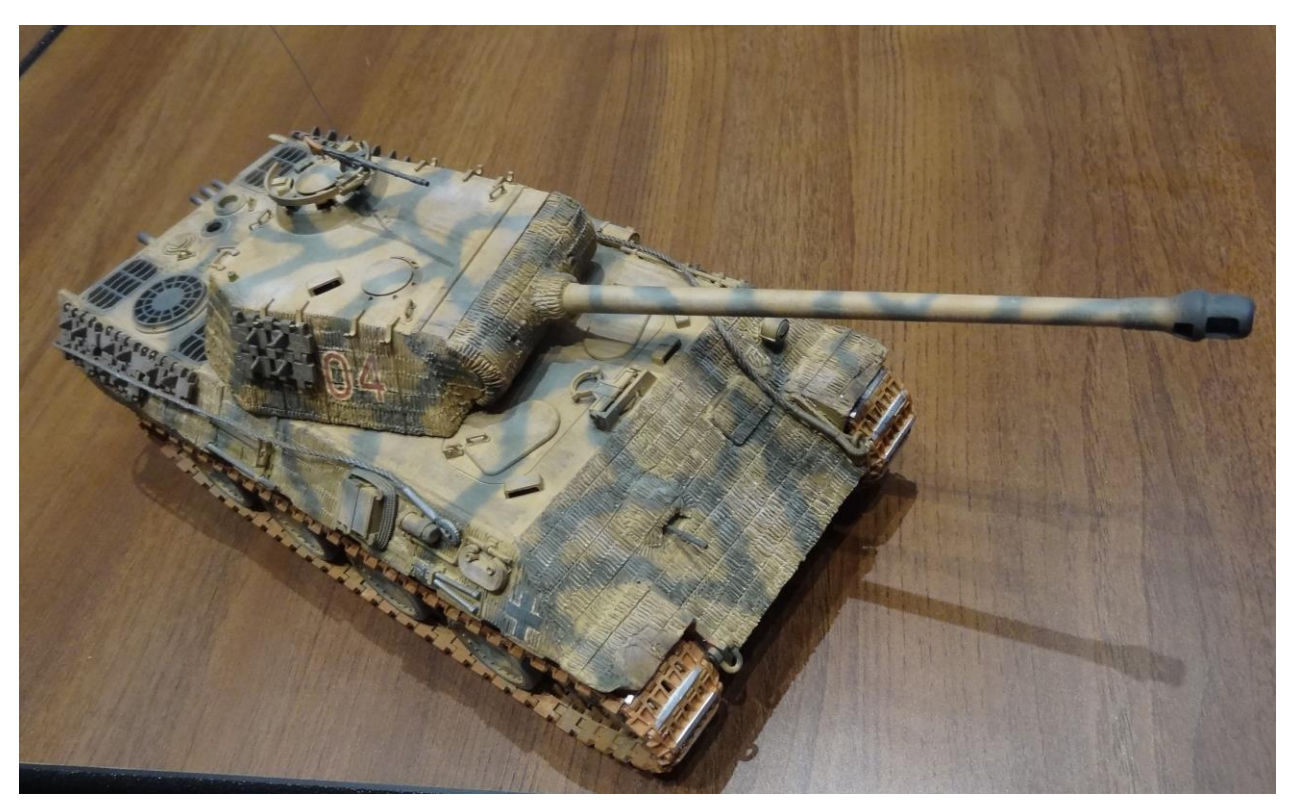
OCTOBER - See Young