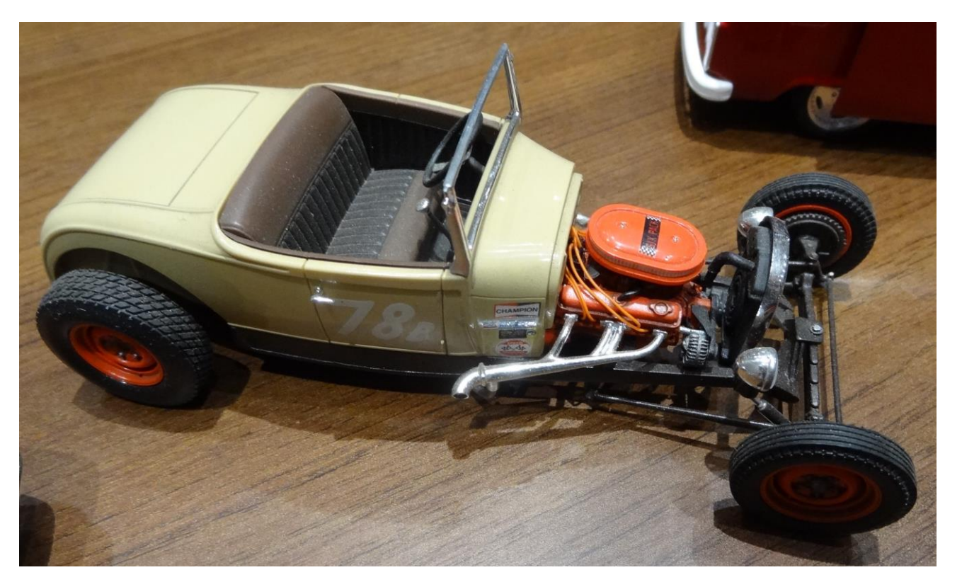
JUNE - Greg Plummer