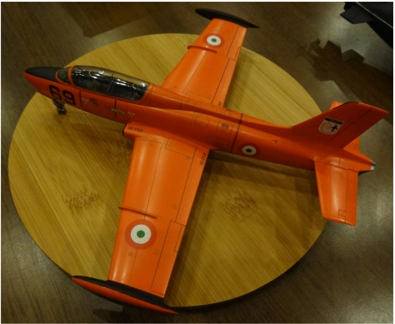
NOVEMBER “S.O.N.S” Honorable Mention for “Orange Impala” Gregory Plummer