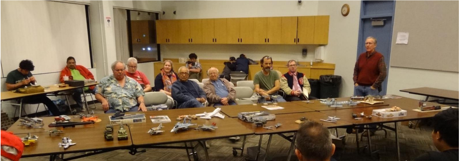
Text: Mick Burton Models: Not One by Mick Burton