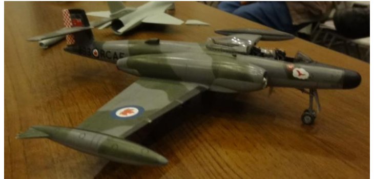
Chris Bucholtz's Avro Canada CF-100 Canuck in 1/72 nd scale done in NATO scheme, was "all Canadian, all the time" from base kit to decals. Unfortunately, the Editor didn't get all the Canadian details to relay to readers here...sorry.