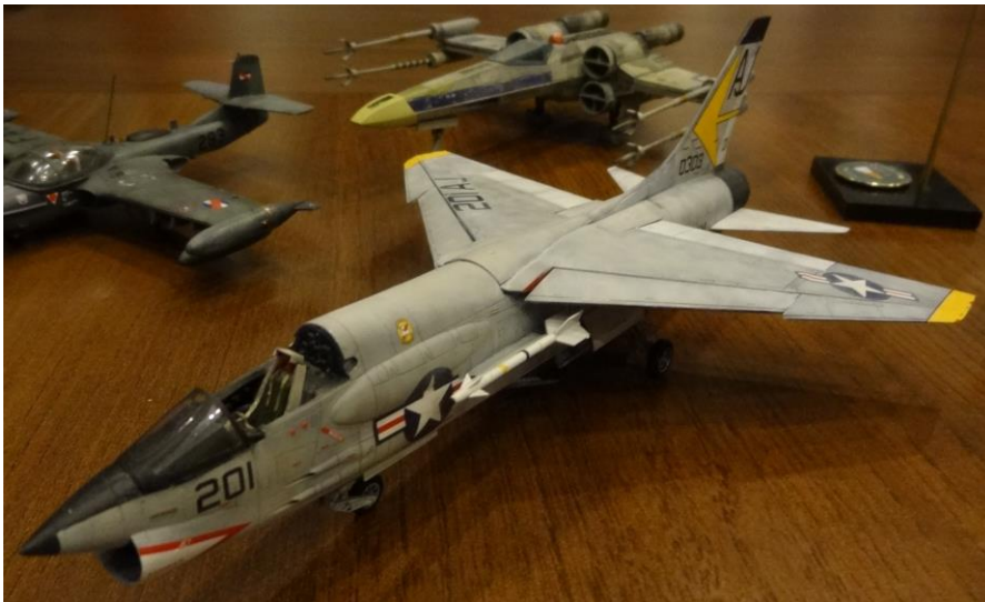
His F8U-1 Crusader -Academy kit with Muroc Models conversion.

Made to configuration of US astronaut John Young's plane from 1958, VF-103