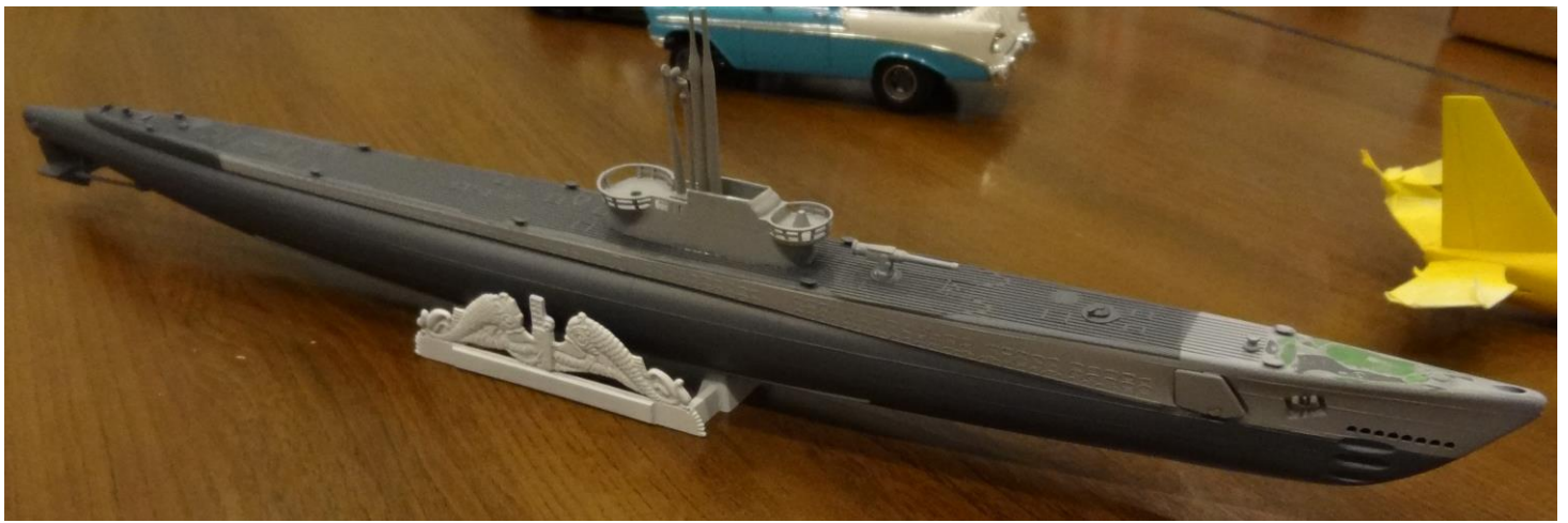
Yes, this is “Airliner Ken” underway with a small scale WW2 USN submersible. Looking forward ☺