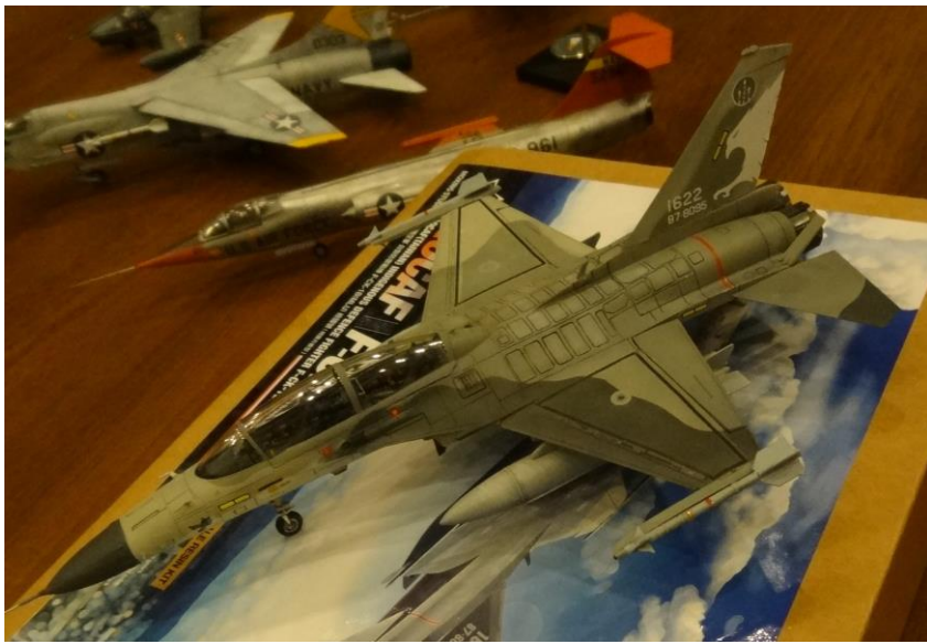
F-CK-1B MLU “ Ching Kuo ” - Moxing Studios resin kit