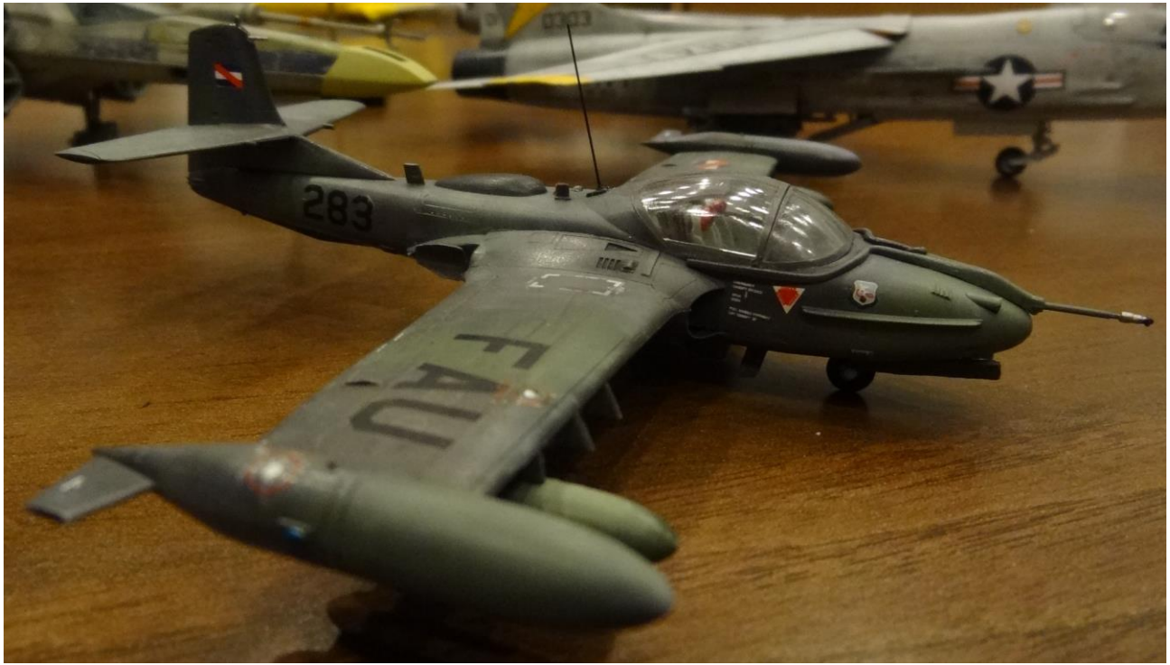
Then there's Jordan's 1/72 nd A-37B -Academy kit, Uruguayan Air Force markings, very nice.