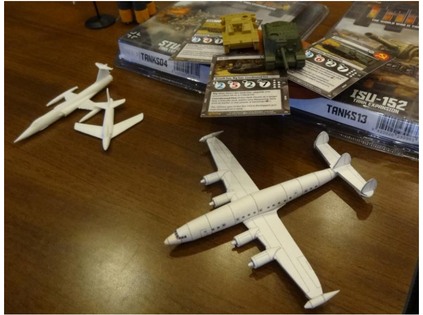
Mark also built game-piece sized armored vehicles, namely an ISU-152 and a StuG III.