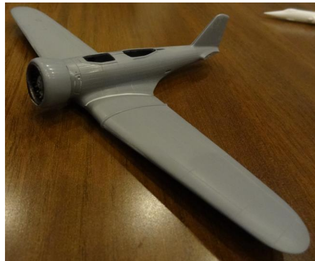
Mark Schynert's latest Northrop Gamma is a model 2C converted from a 2E, and he's made modifications like fashioning a blanking plate for the ventral gondola opening. He's also heavily shimmed the wing roots to eliminate a significant gap.