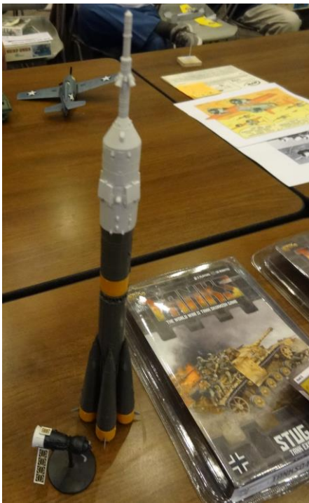
Mark Balderrama showed off his nifty 1:150 Voshkod launch vehicle, a ready-made Japanese model that breaks down into stages.