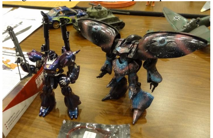
His other Gundam wears space camouflage – black with pink and blue lines, and stars applied by blowing air across a paintbrush dipped in white paint.