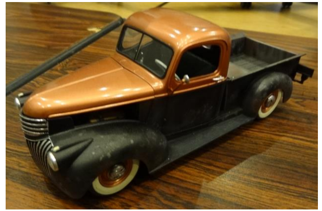
Next up, Greg Plummer reviewed his four winning entries from SVC # 3 as seen here