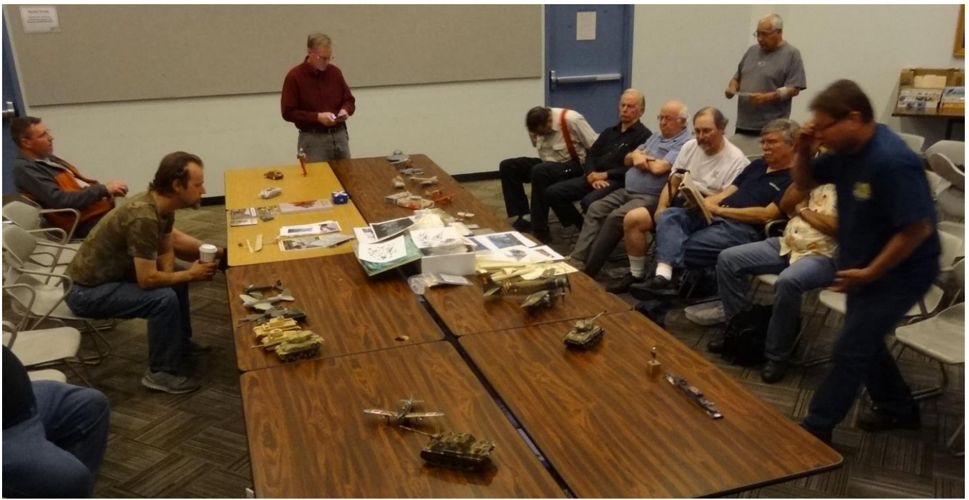
A Club Meeting Recorded Now as Our Usual Suspects Intended , As Rendered by Mistakenly Re-elected Editor ( from 1)

At the May meeting , we leaped right into Model Talk.