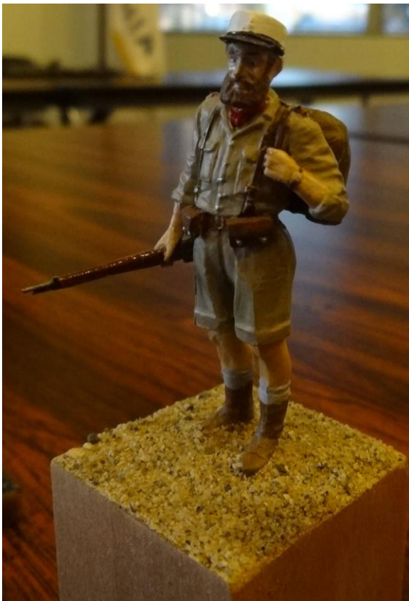
Ron Wergin painted up a MasterBox 1:35 figure of this French Foreign Legionnaire in World War II, and he's also completed a 1:700 model of the seaplane carrier Chiyoda from the Aoshima kit.

Ron says this isn't like Aoshima kits of days past, but he still replaced many of the small details with Pit Road parts or from Aoshima's own aftermarket set. He added the railings using scenic glue and he added N-struts to the tiny F1M floatplanes.