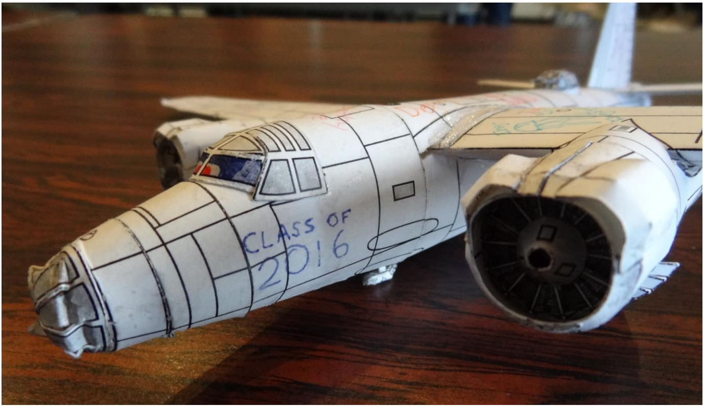
further “props to new 9 th grader” here’s a look at B-26G Marauder “Class of 2016” signed by his classmates. It’s a