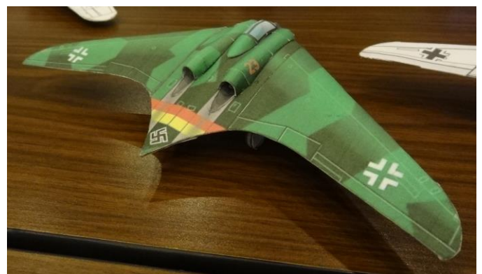
Mark’s other two fine “flat works” were the “winter” and “summer” camo schemes Horten flying wings. Actually the “white wing” is the unpowered proof of concept glide prototype, the green is a “Reich Defence” scheme Gotha Go 229 with the twin jets as intended .