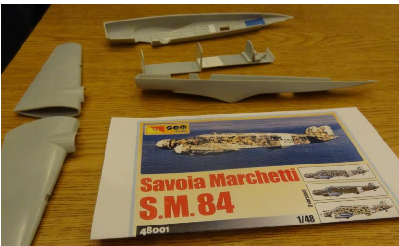
An obscure Italian in 1/48 in WIP, and a WIP Zero-sen on right ...

This Cadillac Gage V-100 is a rather lesser known American Armored car success story for one. Apparently now a quality 1/35 th injected styrene kit now available as seen here.