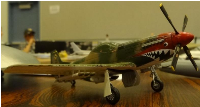
His Airfix Dominican Republic P-51D has just four decals (out of a great many!) to be added for it to be complete, and he's sneaking up on the painting steps for his Pegasus 1:144 Hannebau flying saucer, which will be in USAF markings.