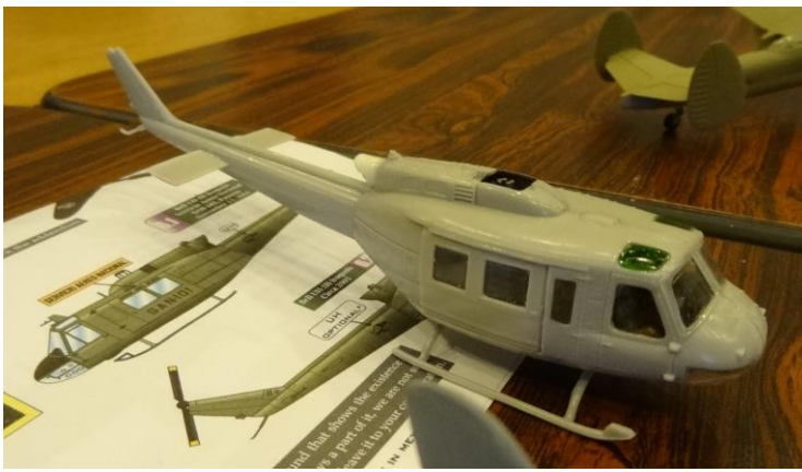
His Panamanian Police UH-1H in 1:72 is nearly ready for paint, but his AZ Models MiG-17 has a ways to go.