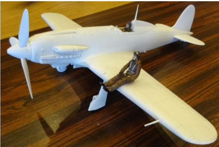
The pre-painted figure that came with the Macchi was enhanced with bushier eyebrows and a thin moustache to make him look more Italian.