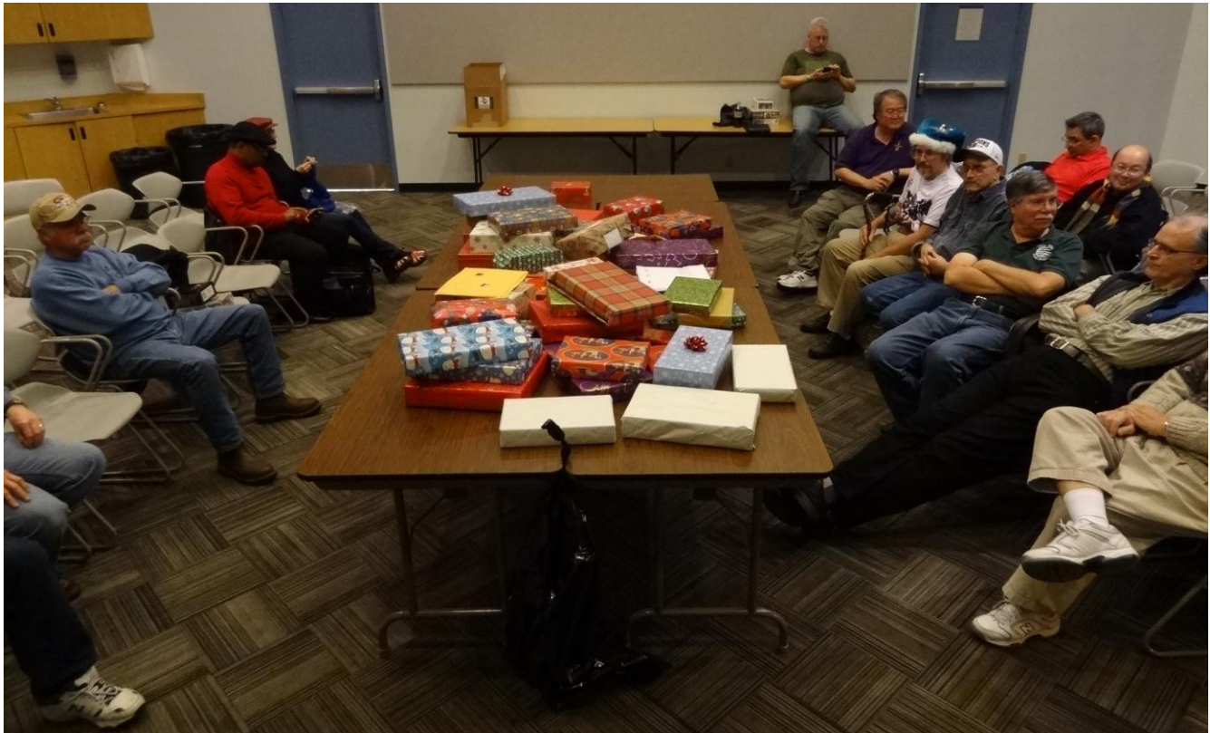
Photos & Text: Mick Burton Gift Wrapped Models : everyone from everywhere

Officially & Deliberately Scant MINUTES of SVSM December Meet by Mick Burton