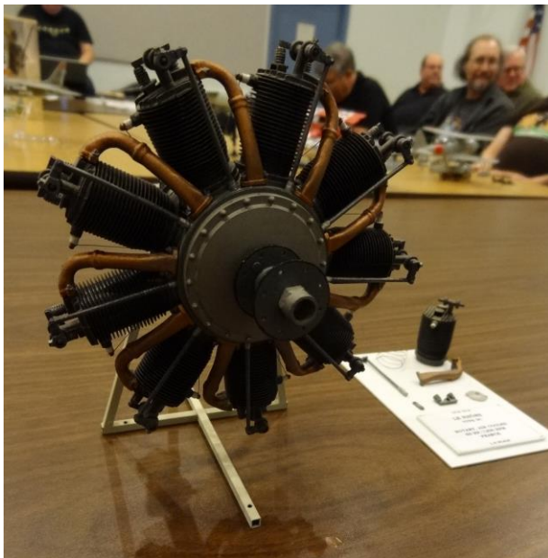
“ 1916 ”