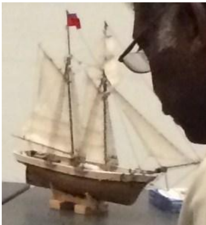
This sailing ship (identity unrecorded, sorry)