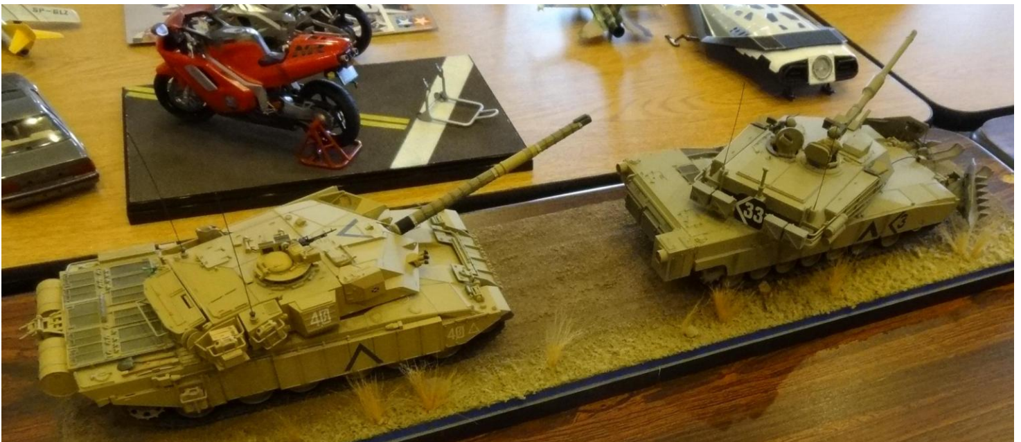
Temo C , having brought a raft of aircraft last month to introduce himself, this meeting shared two excellent 1/35 th USA modern armor vehicles. Plus a pair of large scale modern super bikes. Glad he's chosen us? Sure!