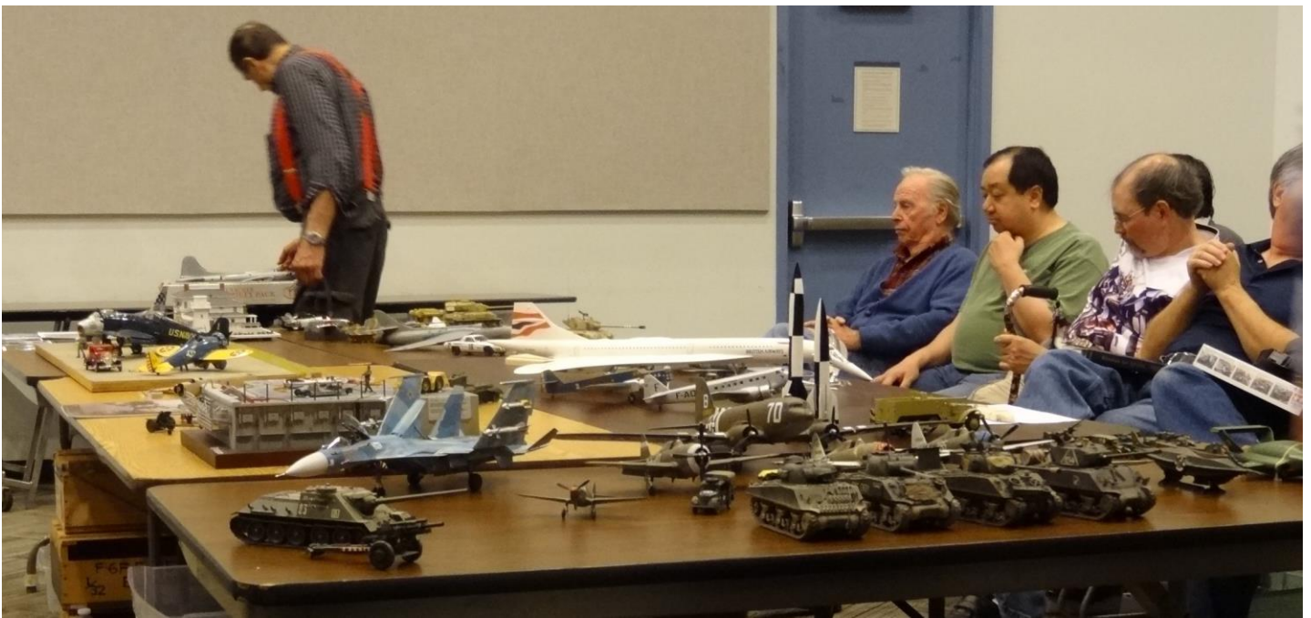
A Club Contest Memorable and a Grand Replica of a Local Landmark Enhance Our Third 2017 Meet (from 1)