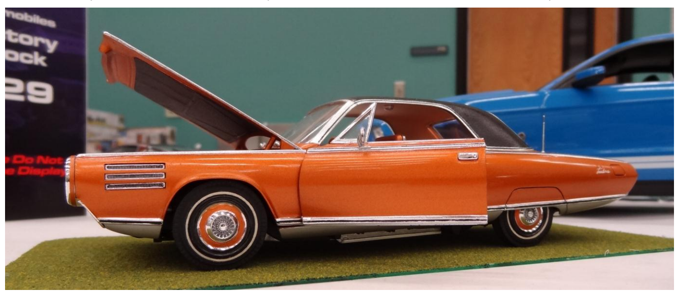
If you don't know, it's Jo-Han's Chrysler Turbine Car (the last one, and only one ever produced in quantity)

Here one of my absolute favorites, in Factory stock. I have built this, seen the real deal few years back on tour.