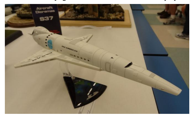
Above, more out of this world competition, 2001 A Space Odyssey film's Orion "Space Clipper" Next to that, a look at what's "Out of the Box"

One pleasant surprise at the show, Yuba City's mobile hobby shop with a major discount offered along with an ability to accept payment cards there at the show. Your editor came across a kit by Hasegawa in 1/48, the space craft "Voyager" launched in 1972 for deep space exploration. Had to have this! Now I'm looking for more!