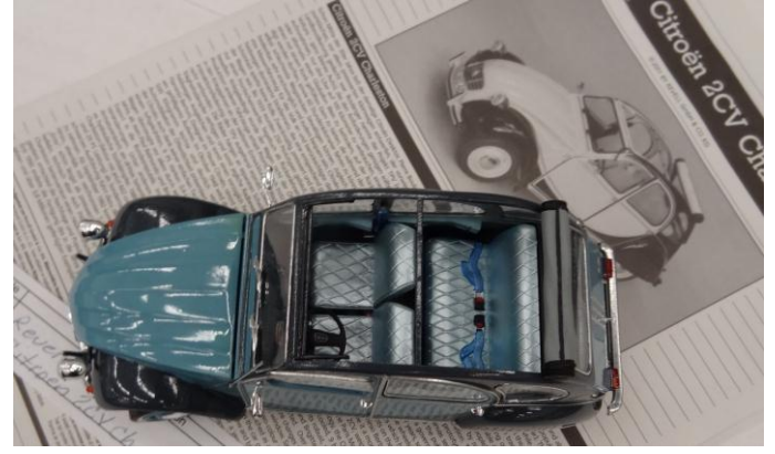
This Citroen 2CV was a charmer in its own right. First time seeing this kit and I must say,