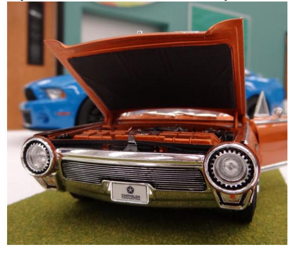
Entrant did in my estimate, a superb job on this and captured the elusive "bronze" paint finish "tight". Which is why I shot so much.