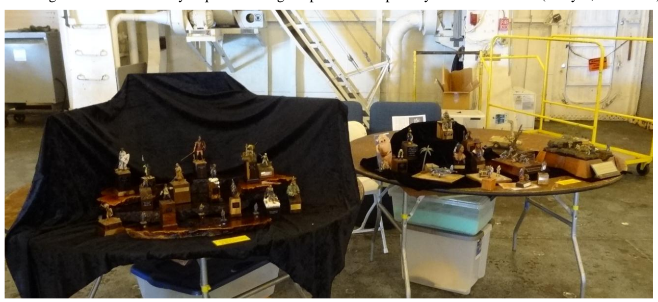
One large number of sincerely requested though expected to be politely declined on offer (and yes, no thanks)