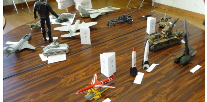
( OK , actual article text continues with MORE pictures, on sheet 7. This was just a convenient way station ...)