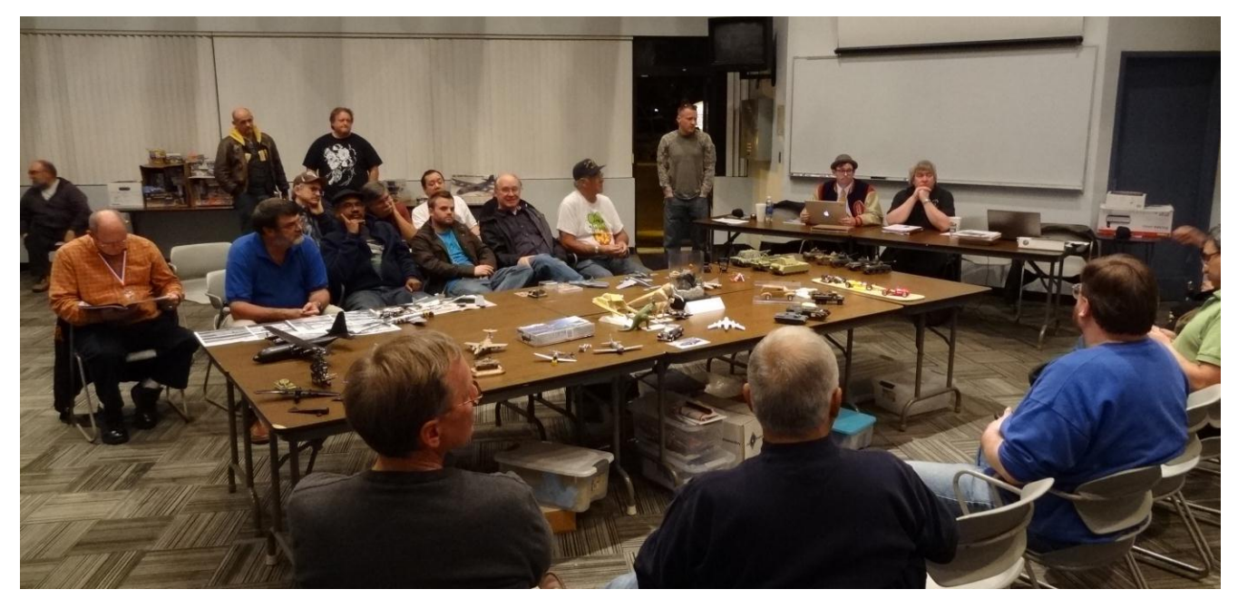
Above, another viewpoint of the excellent variety of attendees and works of art that made November plenty fun.