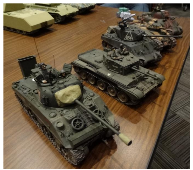
"Frantic" did not win but it was again, an Eye pleaser to me.