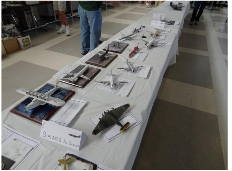
Making Note of Real to Reel Action Down SoCal Way continued