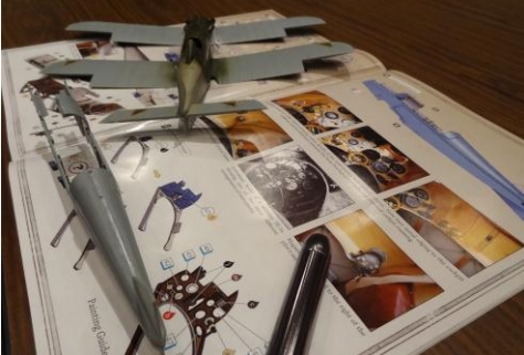
@ left, excellent WIP also got no record this time. Nice work, it's a WNW kit ?....