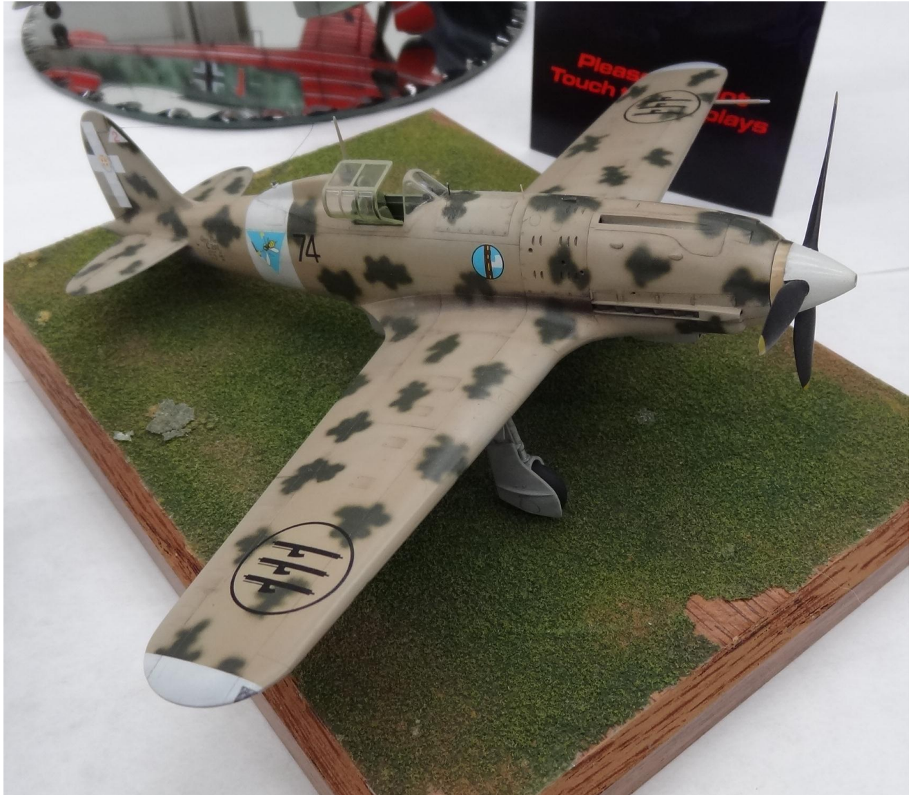
First Timer from SVSM Comes Home Winner as the IPMS Reno High Rollers Host Their # 14 Classic Scattered Recollections and Photos By: Mick Burton