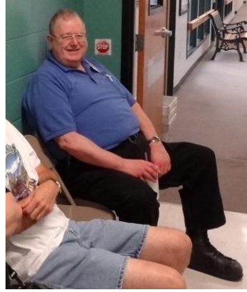
One host seemed to me familiar...