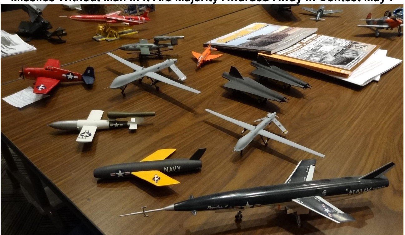
Missiles Without Man In It Are Majority Awarded Away in Contest May !