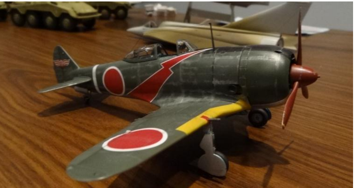
January Model Talk was bit rushed (continued page 8)