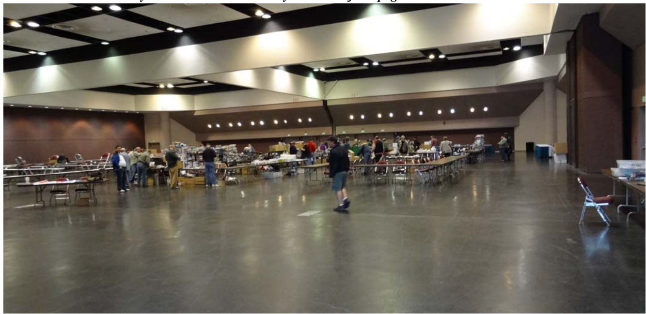
Above, the view of first half hour, taken by Mick Burton as we await arrival of the Sdkfz 222. From the vantage point of rollup doors at rear Hall A.

An Incontestible Fun Day Recounted in Photo Essay continued from page 1